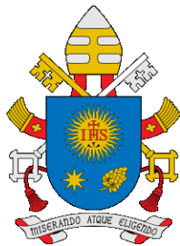
Papal Seal of Pope Francis

the Archbishop. In this capacity, he doubled the number of priests working in the slums of Buenos Aires. Partially as a result of his work as auxiliary bishop of Buenos Aires, his Jesuit superiors asked him in 1992 to avoid residing in Jesuit houses. He complied with the request and did not visit Jesuit residences until sometime after he was elected pope. Created Cardinal by Pope John Paul II in 2001, he retained the position of Archbishop of Buenos Aires until 2011, resigning due to a church law requiring him to do so on attaining age 75.