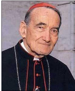
Avery Cardinal Dulles, S.J.

Avery Dulles, S.J., was a Jesuit priest, college professor, theologian and Cardinal of the Catholic Church who is regarded by many as the foremost American Catholic theologian of the post-Vatican II era.